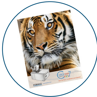
Full-Bleed CMYK Prints Brilliant full-bleed CMYK output on envelopes, and sheets up to 8.5" wide