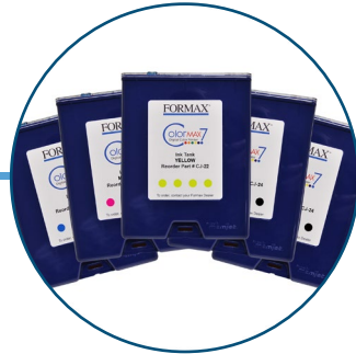
Lower Ink Cost Per-Page Utilizes 5 high-capacity 250ml ink tanks (CMYKK)