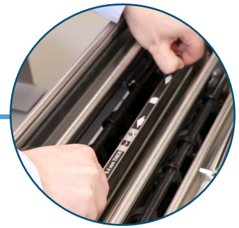
Quick Change Creasing Matrix Easy to swap in just seconds, with no tools required