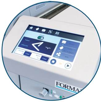
Intuitive Color Touchscreen User-friendly interface with bold icons makes setup quick and easy

The ATLAS C150 High-Speed Automatic Creaser/Perforator is user-friendly solution to the problem of cracking in toner-based digital prints. It features a heavy-duty, lifetime guaranteed creasing matrix for accurate high-speed creasing. Using the intuitive touchscreen control panel , it automatically sets the crease locations, and users can easily store unlimited custom jobs . The top-loading vacuum infeed adjusts automatically to handle media stacks up to 7.8" high and weights from 75-400gsm. With its extra-long infeed table , it can handle sheets up to 51" long. An optional second creasing/perforating blade kit allows for single-pass up/down creasing and cross/partial perforation for hinges, book covers, and more. The rugged metal construction and compact footprint make it ideal for print facilities with limited space.