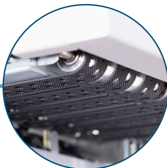
Top Vacuum Feed Controls sheet separation by constantly monitoring and making adjustments