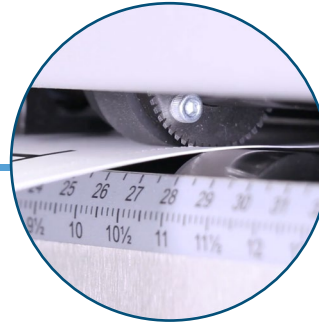
Optional Second Crease/Perforation Kit Allows for single-pass up/down creasing/perforation