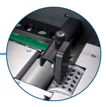
Powerful Air Suction Feed Table Handles coated and non-coated stock, in sizes up to 26.5" long

Belt-Driven Outfeed Stacker Outfeed and infeed are located on the same side, for operator convenience