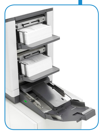
Tower Feeder w/ High-Capacity Trays and Accumulation/Divert Deck

Formax - New Hampshire, USA www.formax.com Local Dealer: