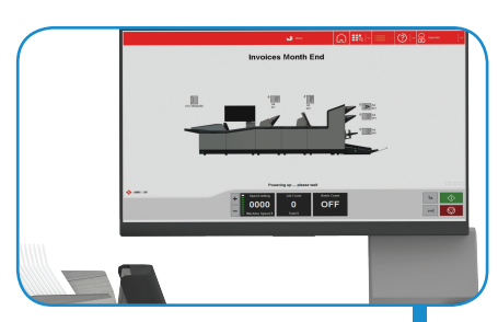
22" Color Touchscreen Interface