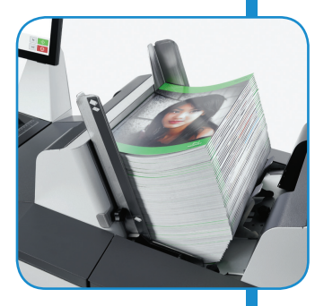
Versatile Insert Feeder