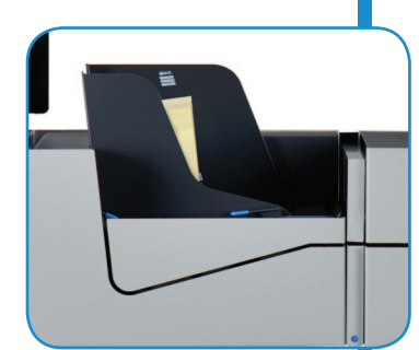
Optional 1 or 2 Thin Booklet Feeders