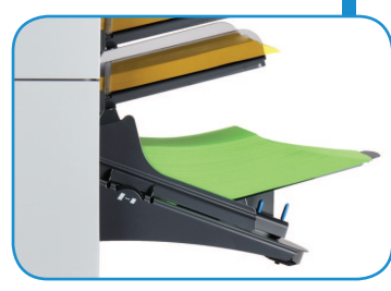
Optional Production Feeder

Formax - New Hampshire, USA www.formax.com Local Dealer: