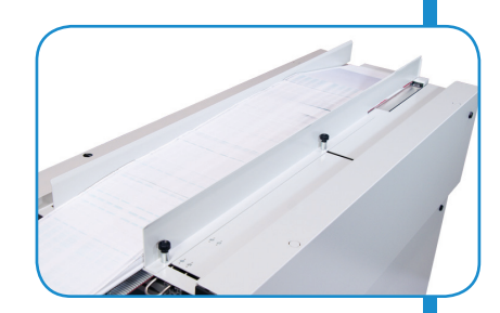
FD 2300-EXT extended air-feed