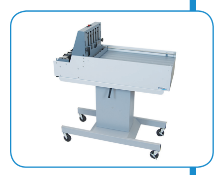
Optional V-Stack36i Vertical Stacker with adjustable-height stand

Formax - New Hampshire, USA www.formax.com