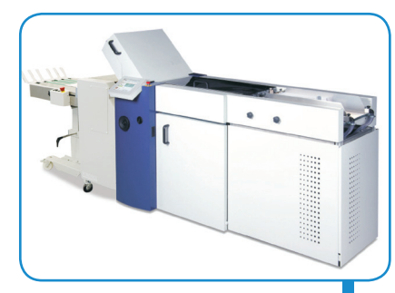
FD 2300 air-feed