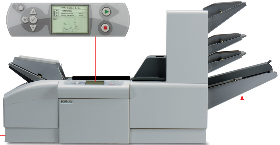
FD 7100-Basic 3 w/ Optional Accumulator