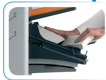
Optional Production Feeder